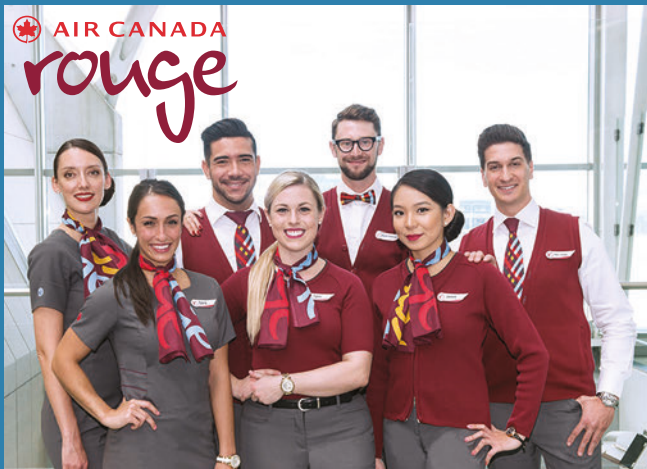
Air Canada Rouge, proud Partner of the LGHF