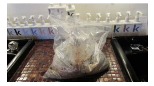
Beaconsfield's Revolution Beauty Salon goes green in a big way – Hair Dye, Hair clippings, foil, recycled how?