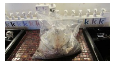
Beaconsfield's Revolution Beauty Salon goes green in a big way – Hair Dye, Hair clippings, foil, recycled how?