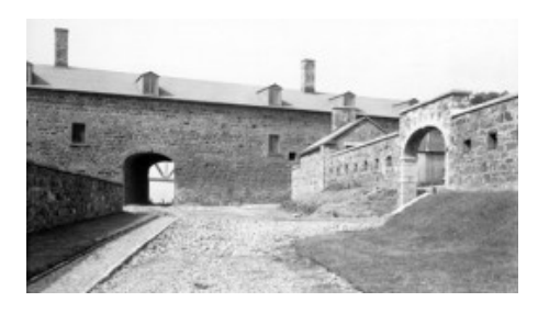
Military Fort on Saint Helen's Island