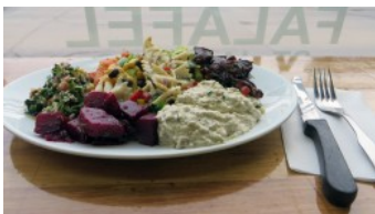
Falafel St. Jacques – Falafel for us all