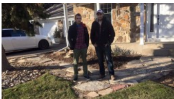
Landscaping company gives back 5% to West Island Community Shares