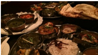
Restaurant Sahib top Indian restaurant in city of Montreal